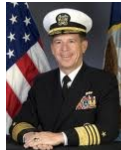
Admiral Mike Mullen

PARADE HIGHLIGHTS: The parade will involve more than 60 veterans groups (including one equestrian team), marching high school bands, the San Diego-based Navy Band Southwest and